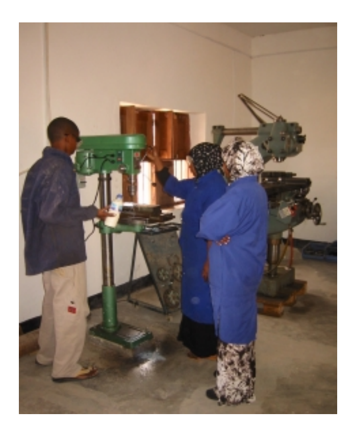
Figure 5. Male and female trainees on a metal work course at a VTC in Puntland being supervised in metal drilling practice by a female assistant trainer.

constraints on the type of work they could do were widows. This offers a real opportunity for the project to exploit for this target beneficiary group.