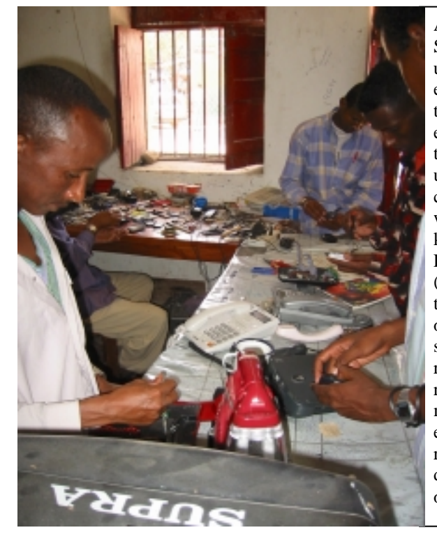
Figure 3. Case study: EBTVET and employment

Hargeisa, incomes of employed EBTVET graduates (i.e. not post-EBTVET 'apprentices') range from US$ 50/month for beauticians to US$ 120/month for auto-mechanics.