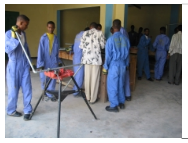
Figure 2. Case study: IBTVET and fee payment.

A well managed VTC in Somaliland visited by the mission offers a 12 month plumbing course with 45 trainees. A course fee of $5/mth is charged. The course fee per student that would need to be charged to cover the actual cost of running the course (trainer salary, consumable materials, VTC overheads, etc) is estimated by the VTC Director to be $25/mth. He attempted to raise the course fee to $13/mth but resistance from the trainees prevented any change in the fee rate. Other course fees charged at this VTC are: typing ($1.5/mth), computing ($10/mth), accounting ($3/mth), secretarial studies ($5/mth. The VTC has a fee waiver scheme for 20% of its students that are known to come from poor families.